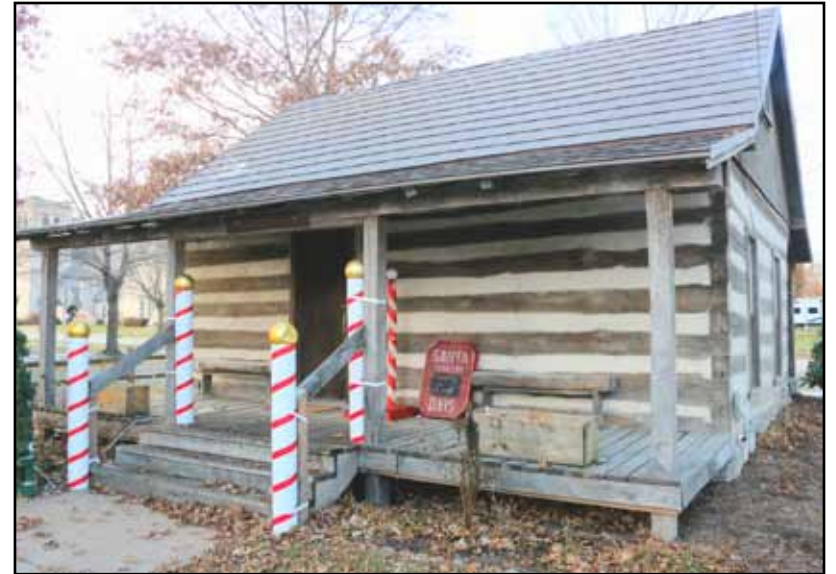
Photo opportunities at the log cabin

Capture the magic of the season with festive photo opportunities at the charming log cabin next on Michigan Avenue (Illinois Route 1) next to the Fire House. Bring your camera and take pictures in front of the beautifully decorated cabin, perfect for creating lasting memories with family and friends!