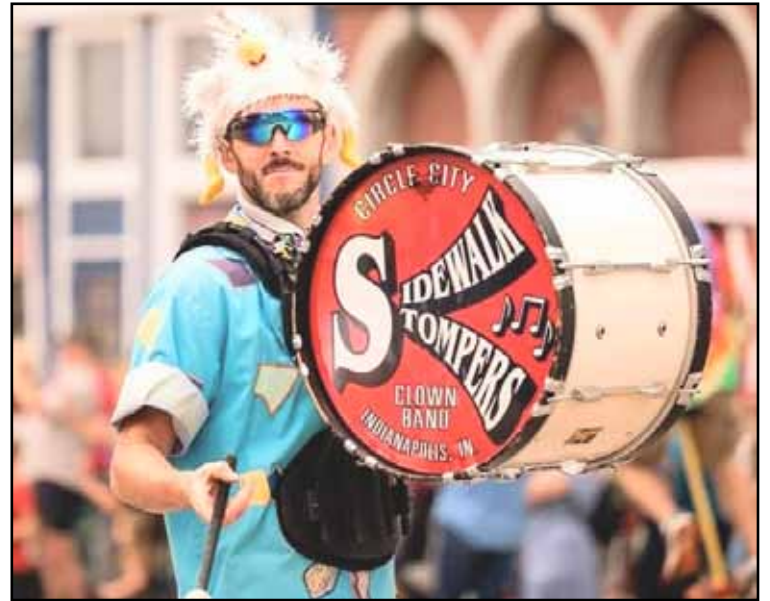
The band has also per-

As word of the talented musicians and their high energy show spread, the group began appearing in fairs across the country such as the San Diego Fair, the New York State Fair, the Wisconsin State Fair, and the Alaska State Fair.