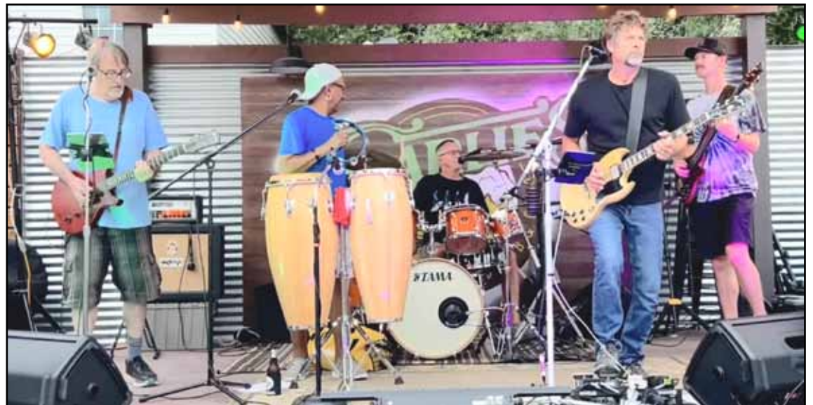
The Grand Turn Band will perform Sunday from 1 to 4 p.m. at the VFW.