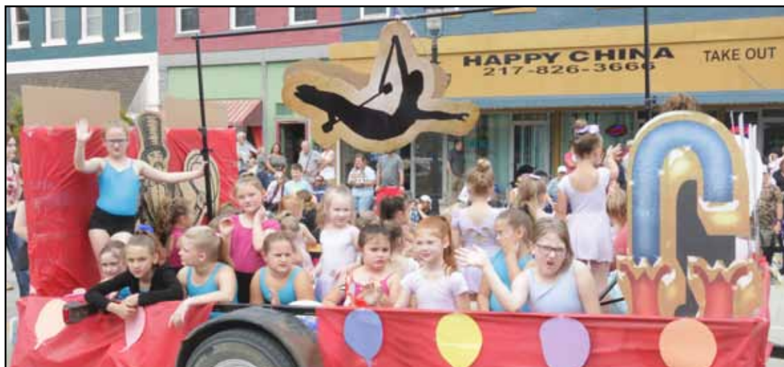
The Fuzion Dance Studio float (above) and Casey State Bank float (below) in 2023 Autumn Fest Parade.