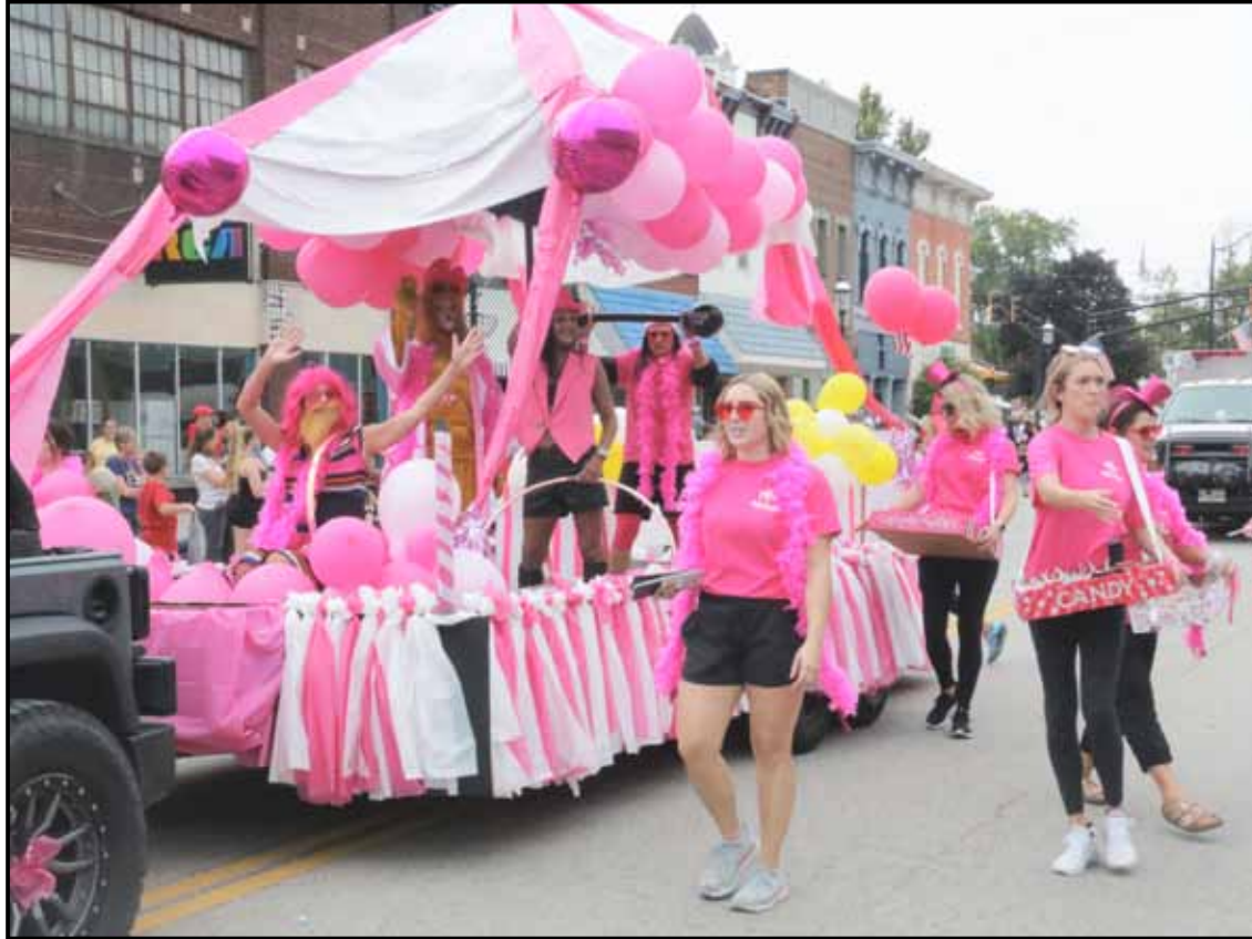
The Marshall Milkmaids float in 2023 Autumn Fest Parade.

courthouse square at 6:15 p.m. will be the Autumn Fest Prince and Princess coronation.