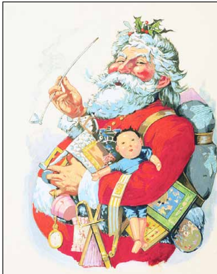
“Merry Old Santa Claus” by Thomas Nast.

Puritan distaste for the holiday traveled over the Atlantic. John Winthrop of Massachusetts Bay had no use for Christmas. Other settlers in other colonies, depending on their origin